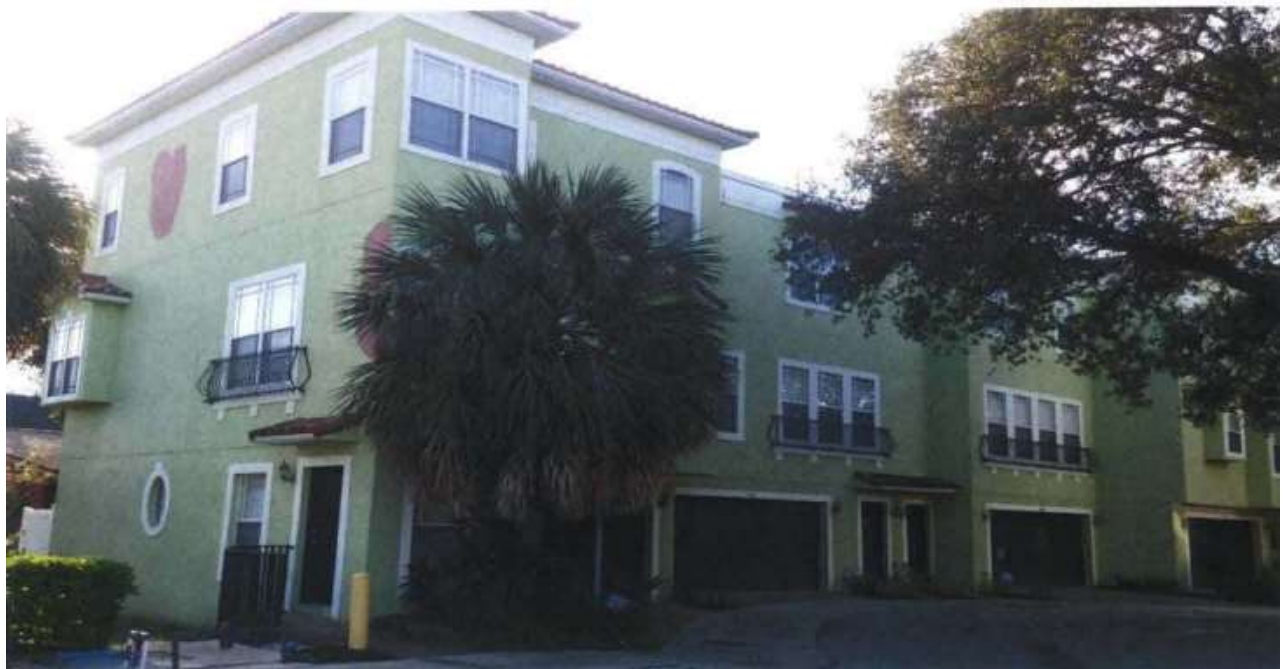
Before and After Las Villas Townhomes