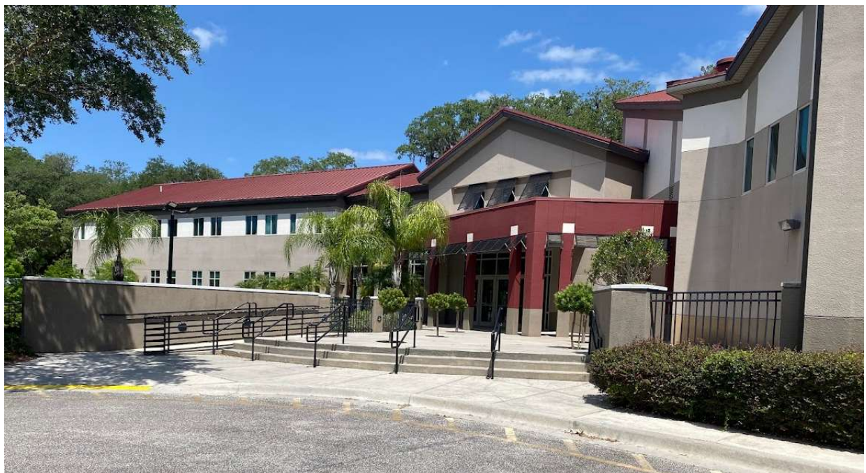
Temple Terrace Church of Christ