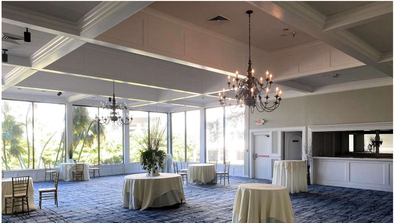
Before & After Rusty Pelican Banquet Hall