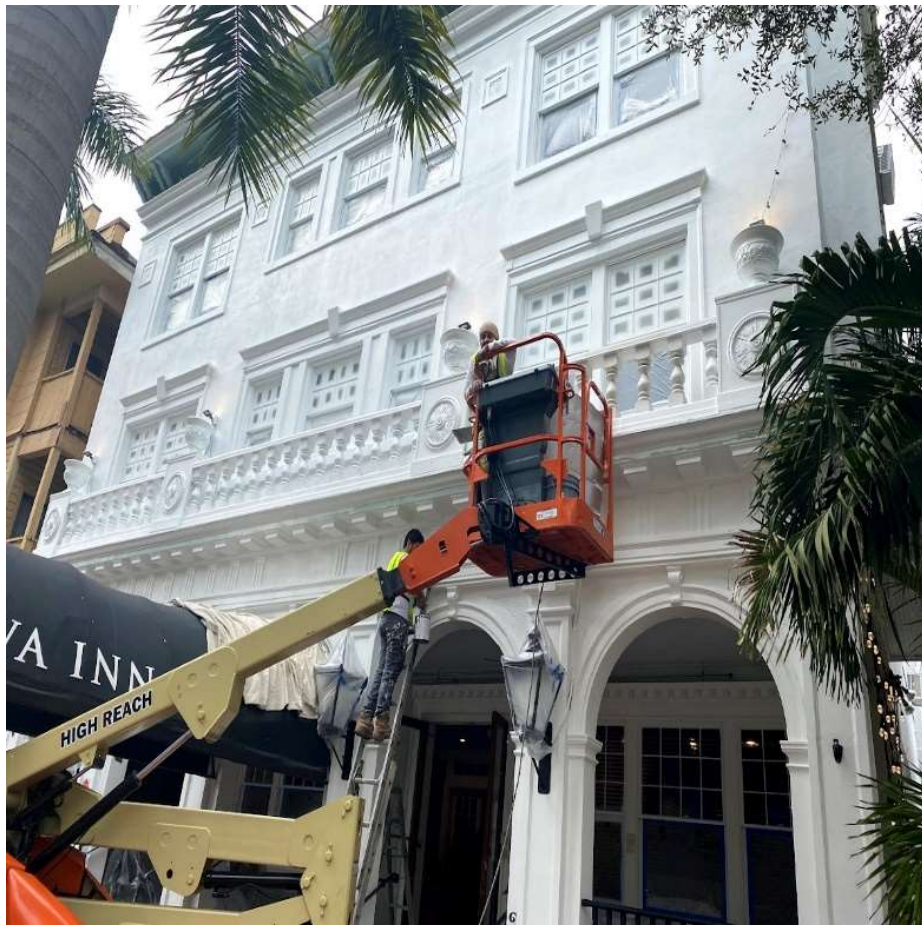
Historic St. Pete Hotel