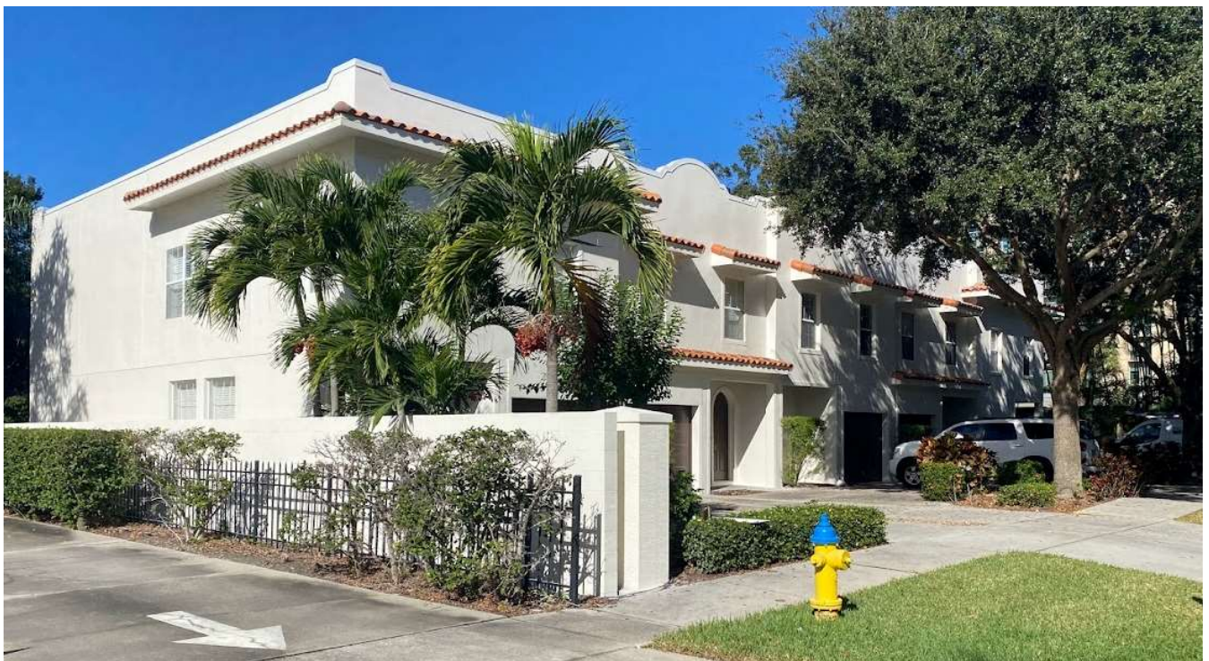
Before and After Villas of South Gomez