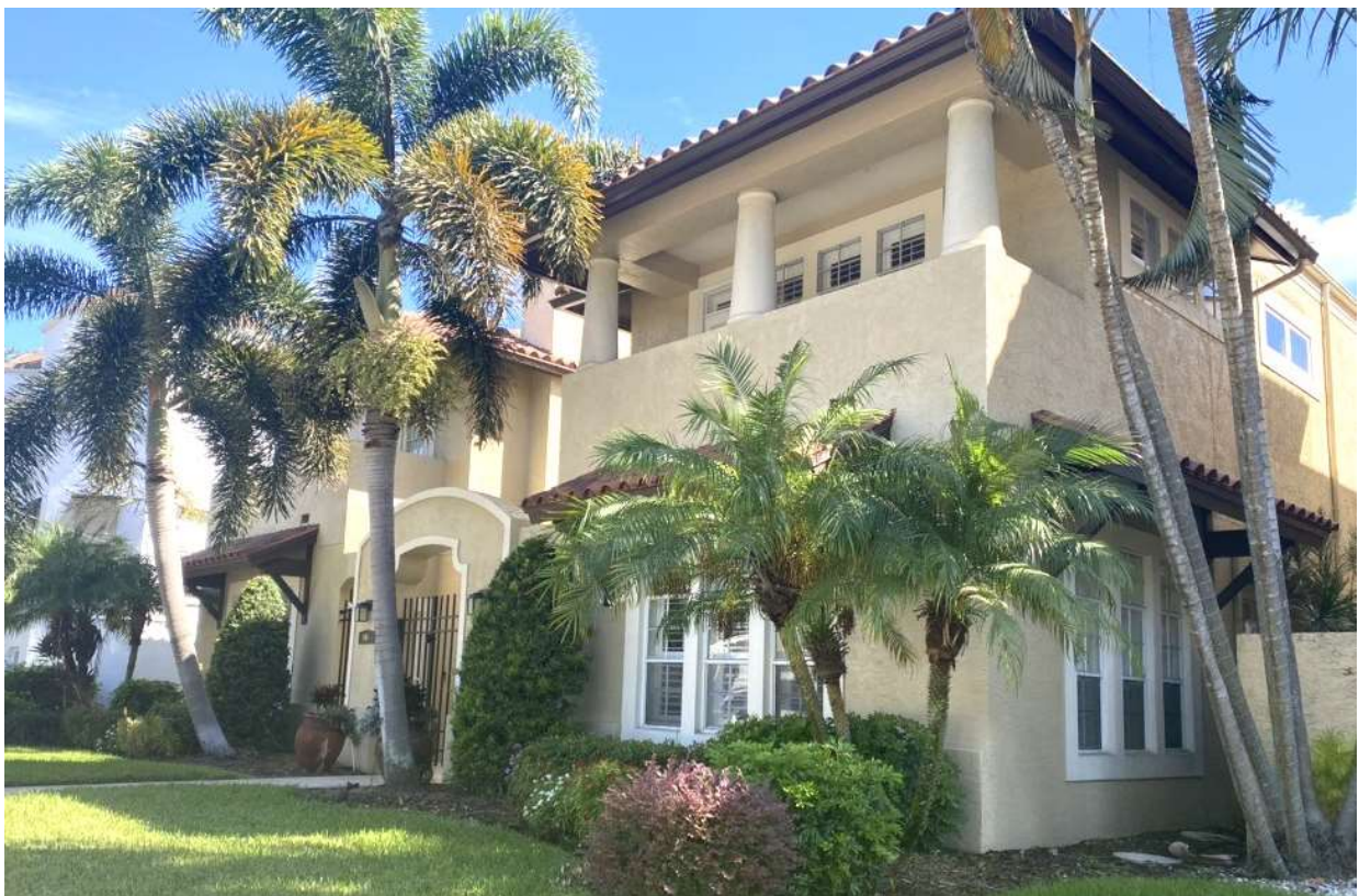
Before and After Hyde Park Townhome