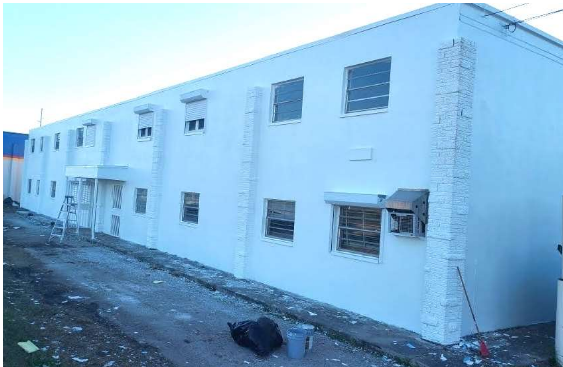
Before and After Warehouse Building in Pinellas Park